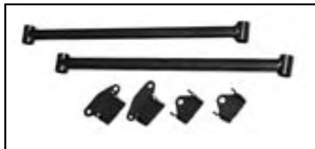
Part # LCSB260 for 2002-2003 1500 Ram Pickup 4WD shown.

KIT NOTES: K14. Lateral Strut Bars are Only Designed to Work with Skyjacker® Suspension Lifts.